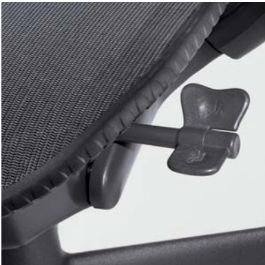
Fitting the sitter and task