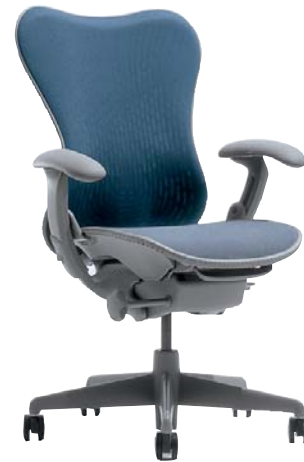
Mirra chair with upholstered back option