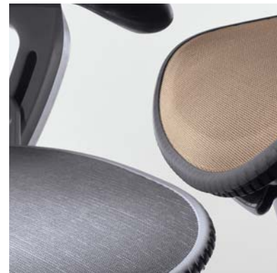
User-controlled seat depth